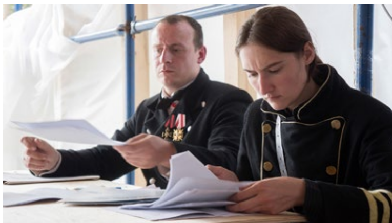
Officials handling papers at court hearing.

Larp-poem 1905 sported a hefty set of rules and meta-techniques, of which only the most important can be covered here. Many aspects of the game were determined by rules. One fundamental rule was that things only mattered if they were written down. Letters, contracts, articles and even propaganda leaflets became very important, and there was much play around them.